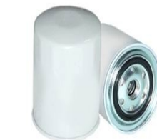
REPRESENTATIVE FC-1801-2 ES-13625