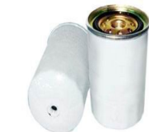
REPRESENTATIVE FC-1802 ES-13627