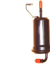
REPRESENTATIVE FS-11660 ES-13617