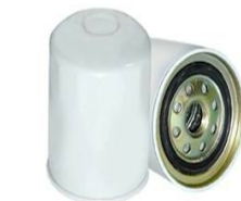
REPRESENTATIVE FC-1801-1 ES-13624