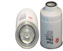
REPRESENTATIVE FC-1707 ES-13622