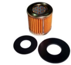
REPRESENTATIVE F-5219 ES-13630