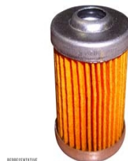
REPRESENTATIVE F-5224 ES-13633