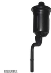
REPRESENTATIVE FS-11680 ES-13618