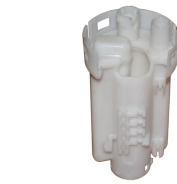
REPRESENTATIVE FS-1157 ES-13612