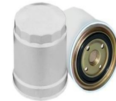
REPRESENTATIVE FC-1706 ES-13621