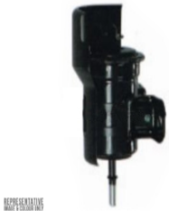
REPRESENTATIVE FS-1154 ES-13611