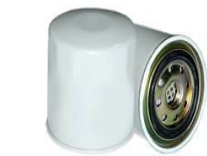
REPRESENTATIVE FC-1801 ES-13623