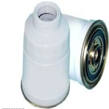
REPRESENTATIVE FC-1704 ES-13619