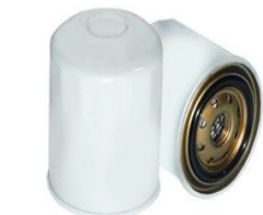
REPRESENTATIVE FC-1801-3 ES-13626