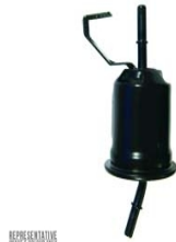
REPRESENTATIVE FS-11651 ES-13616