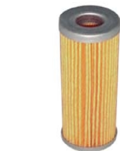
REPRESENTATIVE F-5222 ES-13632