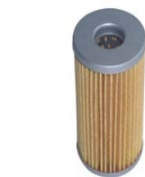
REPRESENTATIVE F-5220 ES-13631