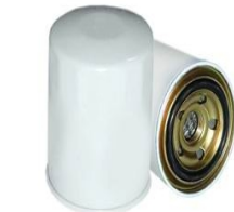
REPRESENTATIVE FC-1705 ES-13620