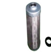
REPRESENTATIVE F-5218 ES-13629